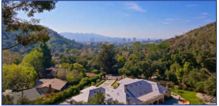
View from the lot towards the city of Glendale

Drive by and experience this unique enclave, the amazing views, privacy yet being under 1 mile from major amenities.