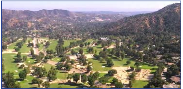
The lot is less than a mile from Oakmont Country Club

Seller will consider all reasonable offers.