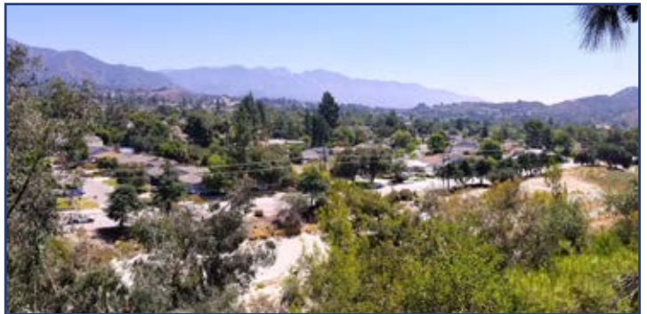
View from the lot