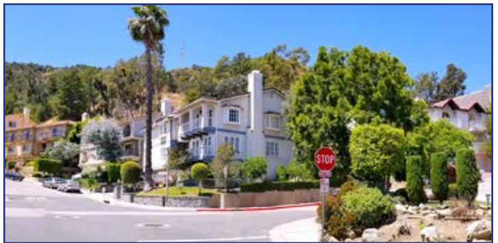
View of the neighborhood